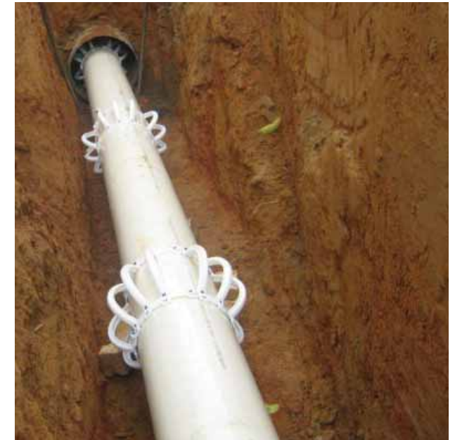
HD-75 being used on a 250mm OD pipe for a sewer installation in Queensland.

Important: Check pre-assembled spacer against pipe diameter before tightening on pipe.